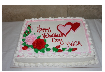
The Friends Board hosted a Valentine's Day party for YWCA residents on Feb. 24. About 70 women and children who reside at the YWCA enjoyed a fun evening of dinner, raffle prizes, dancing and karaoke, and kids' activities.