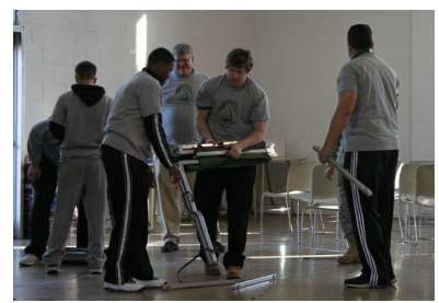
Members of the Trinity High School football team assemble cots at the 8th Annual Harrisburg Homeless Veterans Stand Down Feb. 28-March 2 at the PA Army National Guard Armory. More than 50 homeless veterans were served during the three-day event.