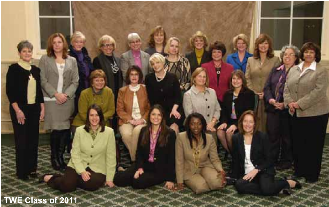
TWE Class of 2011