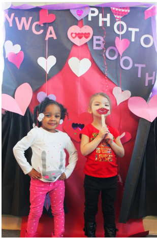
Kids strike a pose in a homemade photo booth that was part of the YWCA's Child Development Programs' Valentine's Day festivities.