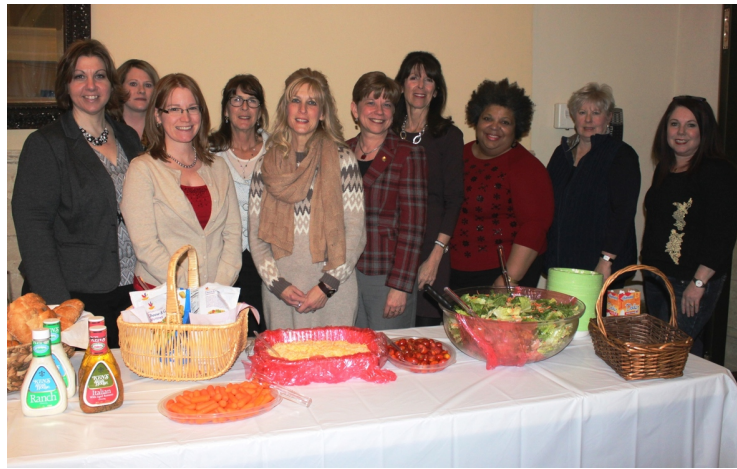
The Friends Board hosted a Valentine's Day party for YWCA residents on Feb. 5. About 50 women and children who reside at the YWCA enjoyed a fun evening of dinner, raffle prizes, dancing and karaoke, and kids' activities.