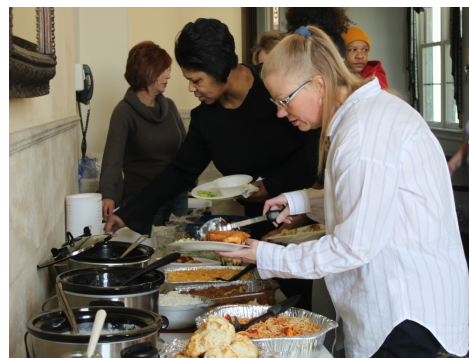
In celebration of Black History Month, YWCA staff enjoyed a diverse array of home-cooked goodies during the 3rd annual Soul Food Cookoff on Feb. 27.