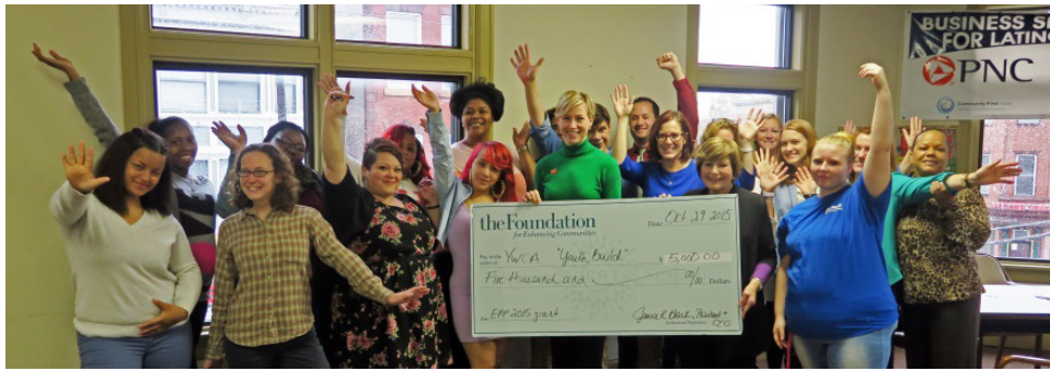
Members of the END Department receiving an award from The Foundation for Enhancing Communities

The Economic and Neighborhood Development (END) Department at the YWCA of Greater Harrisburg provides employment services and job readiness training that will lead consumers to employment, increased income, residential stability and greater self-determination.