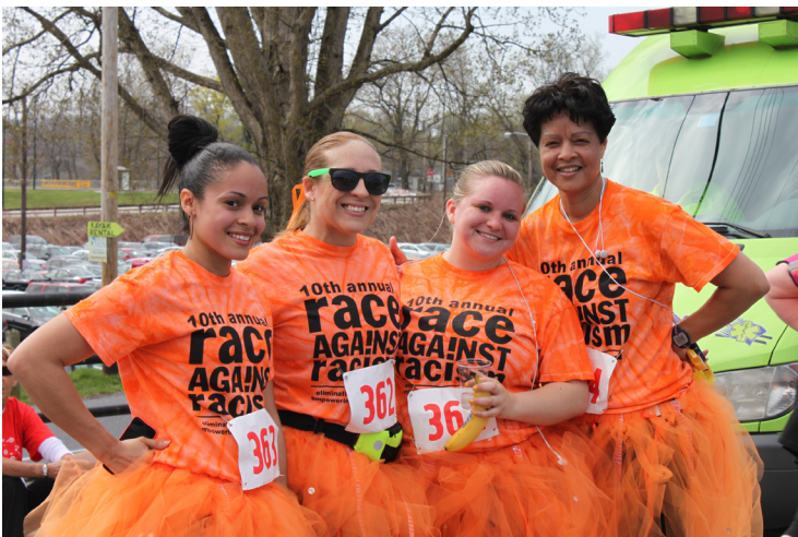
YWCA staff at the Race Against Racism

Following the Race will be a Humanity Festival featuring culturally diverse entertainers, food, vendors and fun activities for children of all ages. If your organization is interested in hosting an exhibitor table at the festival, please complete and submit our Exhibitor Registration Form .