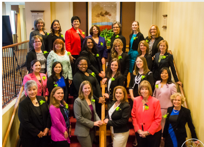
The Tribute to Women of Excellence Class of 2015